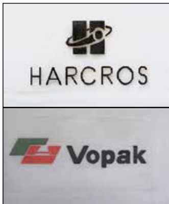
Molded-in Company or Product Information can be permanently embossed with proprietary company information.